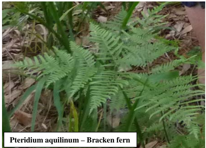
Pteridium aquilinum – Bracken fern