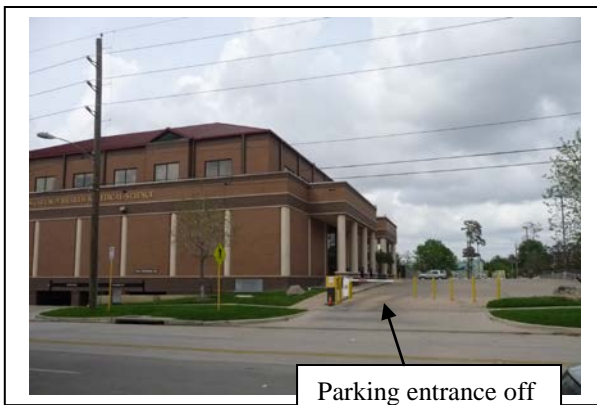
Parking entrance off of Hermann Drive