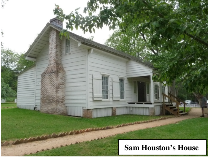
Sam Houston's House