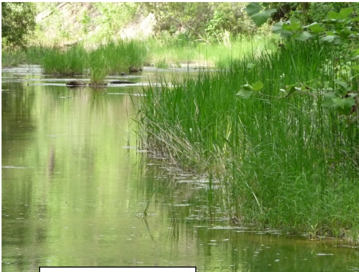
Equisetum - Horsetails