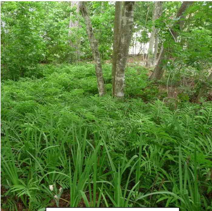
Onoclea sensibilis - Sensitive Fern