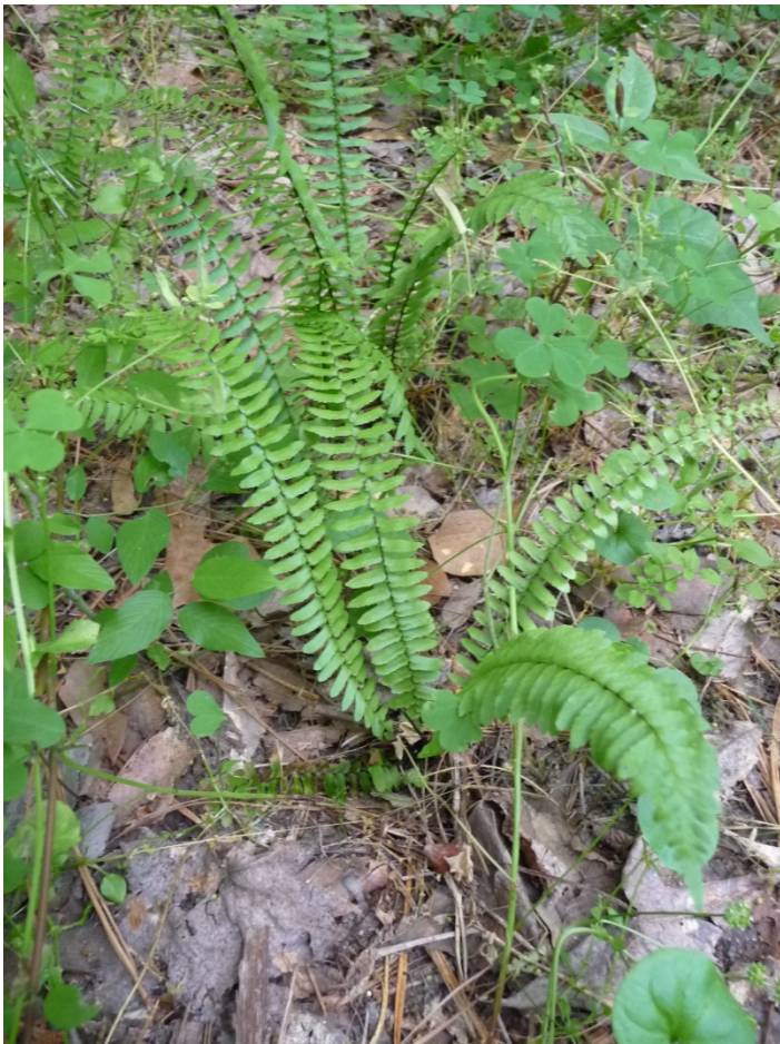
Asplenium platyneuron – Ebony spleenwort