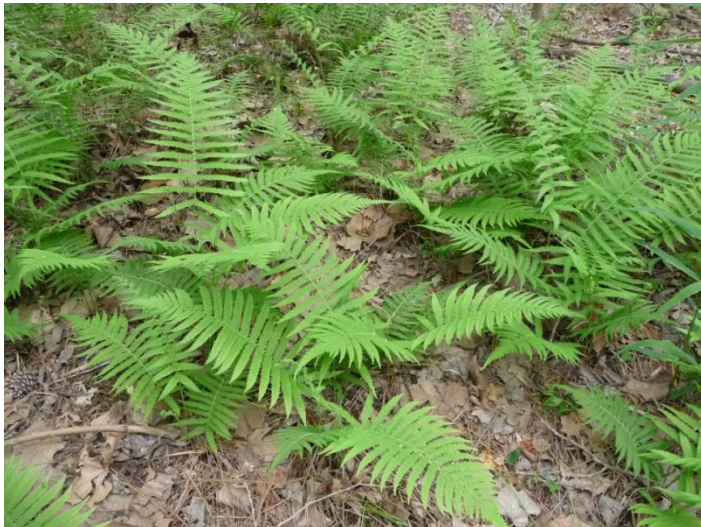
Thelypteris kunthii – Southern Shield Fern